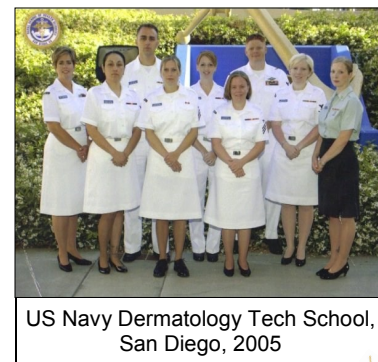
US Navy Dermatology Tech School, San Diego, 2005